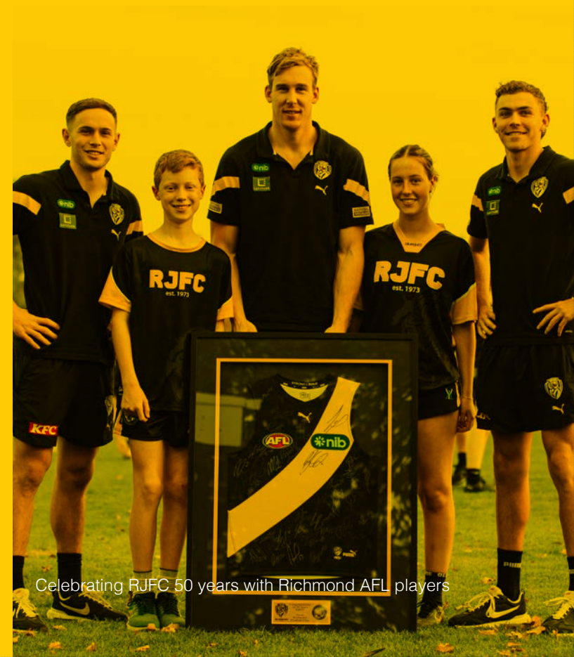
Celebrating RJFC 50 years with Richmond AFL players

President – on behalf of the RJFC Club Committee