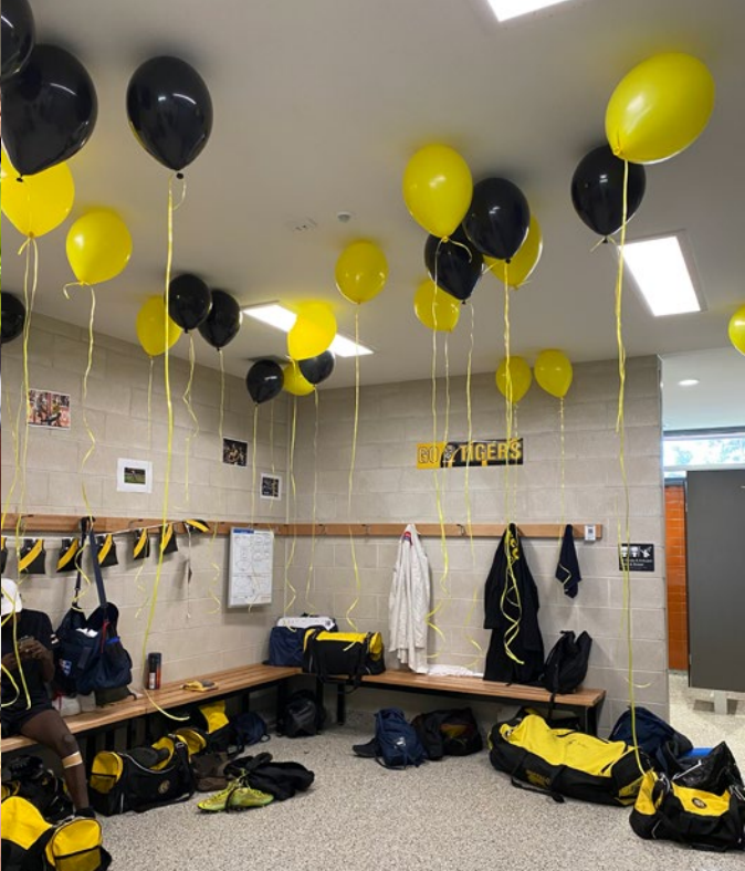
U/15 Boys Division 2 Premiers 2022